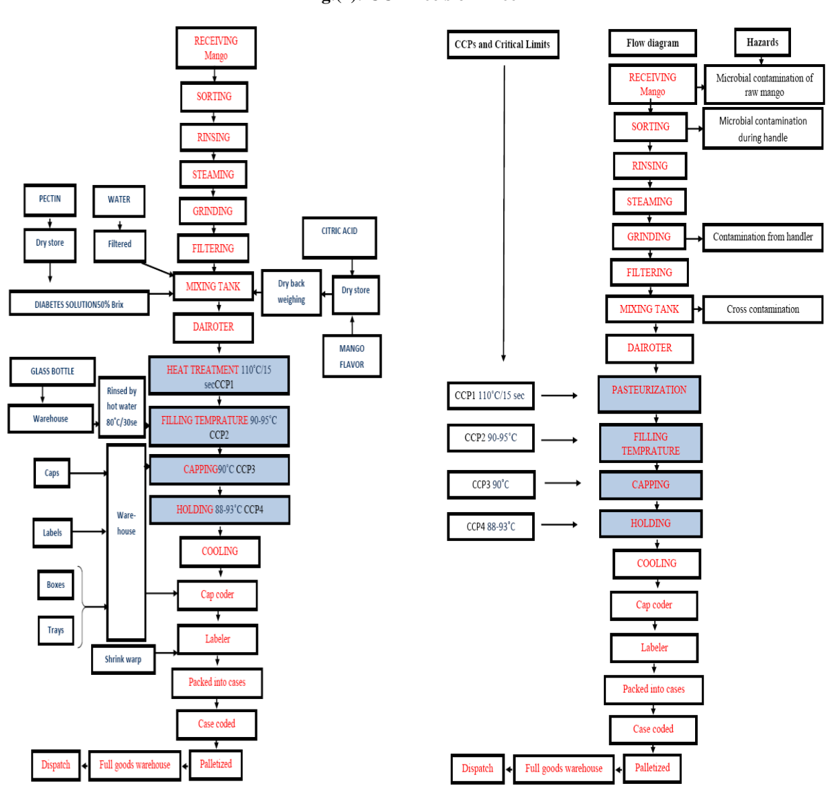
Fig. (2): Flow diagram of mango juice preparation.