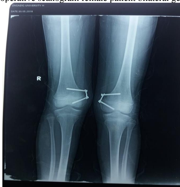
Figure 4: one year post operative x-ray shows correction of deformity by eight plate