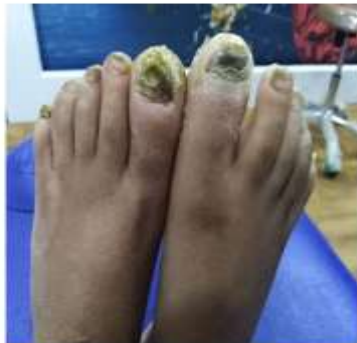
Figure 1 Dystrophic toe nails with subungual hyperkeratosis

plates and wedge-shaped deformity of the nails. This resulted in the upward growth of the distal edge of the nail plates [Figure 1],[Figure 2],[Figure 3] . Besides, there were numerous, hyperkeratotic lesions over the entire body, concentrated over both knees, legs and flanks [Figure 4],[Figure 5] . Marked hyperhidrosis of the palms and soles was observed. Palmoplantarkeratoderma was present, along with painful ulcerated plaques [Figure 6] . Routine laboratory investigations including complete hemogram, hepatic profile, and renal profile were within normal limits. KOH microscopy and culture of nail clippings was negative. Skin biopsy from a hyperkeratotic lesion from the leg, showed orthokeratosis and acanthosis [Figure 7] . No evidence of any malignancy was found during the thorough work up. Genetic and molecular biological studies could not be carried out due to lack of infrastructure facilities. Based on the above findings, he was diagnosed as pachonychia congenita type II.