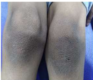
Figure 4 Follicular hyperkeratosis of knees