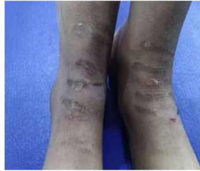
Figure 5 hyperkeratotic plaque