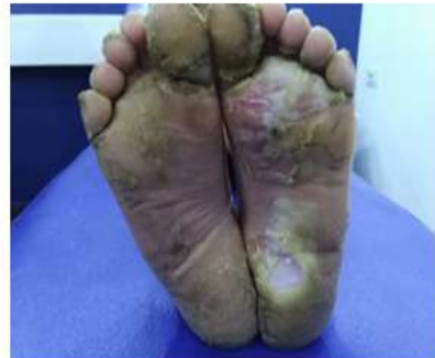
Figure 6 plantar keratoderma