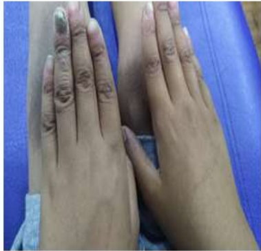
Figure 2 Dystrophic finger nail with wedge-shaped deformity