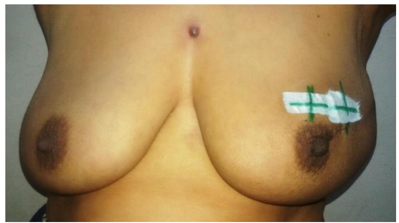
Fig 3 post operative follow up