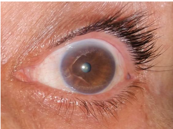
Figure (6): At the end of sixth post operative month, the cornea was clear and no evidence of recurrence.

At the 6th month post operative the cornea was clear ( Figure 6 ), BCVA was 6/6, IoP was 14 mmHg, fundus was normal and no evidence of recurrence.