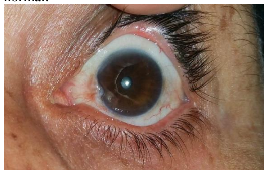
Figure (1): Pre operative primary nasal pterygium grade (I).

46 years old male patient with 3 years history of pterygium progression. There was no history of any ocular trauma, ocular surgery, systemic disorder and drug intake. Pre operative assessment reveals that she had primary nasal pterygium grade (I) of her left eye (Figure 1), her UCVA was 6/9 and BCVA 6/6, IoP was 13 mmHg, cornea was normal clear, no limitation of eye movement in all directions and fundus examination was normal.