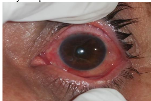
Figure (2): At the first post operative day, the graft was in position, no graft edema, no sub graft hemorrhage but there was corneal epithelial defect. one week later, the graft was in position (Figure 3), there was no corneal epithelial defect (complete re-epithelization), no graft edema, no sub graft hemorrhage, BCVA was 6/6, IoP was 14 mmHg and fundus was normal.

In the first day post-operative the graft was in position (Figure 2), there was corneal epithelial defect, no graft edema, no sub graft hemorrhage and no evidence of early complications.