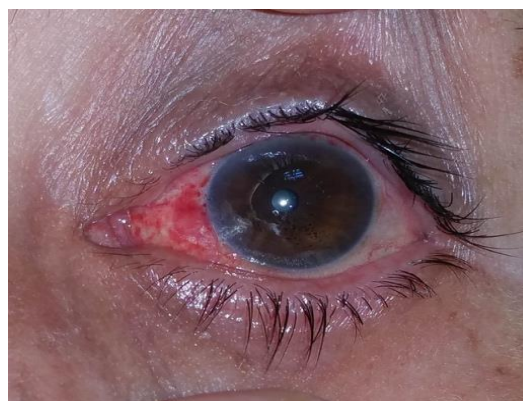
Figure (3): At the first post operative week, the graft was in position, no graft edema, no sub graft hemorrhage and the cornea had a complete re-epithelization.

At the first month post operative, the graft was in position (totally attached), there was no corneal epithelial defect, no graft edema, no sub graft hemorrhage (Figure 4), BCVA was 6/6, IoP was 13 mmHg, fundus was normal and no evidence of late complications.