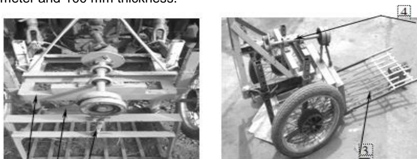
1- Frame 2- Digging blade 3- Separating 4- Transmission unit 5- Reciprocating link

Frame: It is made of squared steel with dimensions of 50 × 50 × 7mm. It takes a rectangular shape (600 × 550mm) and it includes elements to convey rotary movement from tractor PTO to a cam. The hitching system was connecting with the front frame and it was supplying with digger and elevators. The digger frame is holding with two tire wheels of 600 mm diameter and 100 mm thickness.