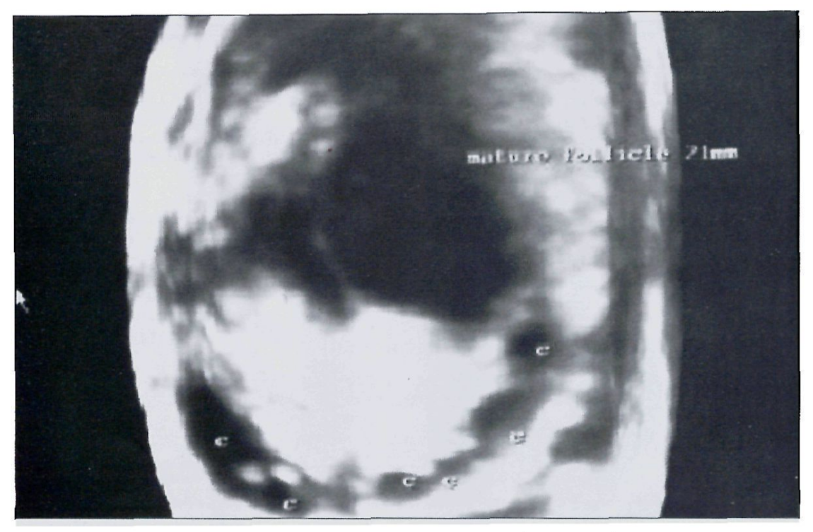
Figure 4. A mature follicle containing cumulus oophorus (white arrow) as it is seen by 3D TV US. In a case of PCO