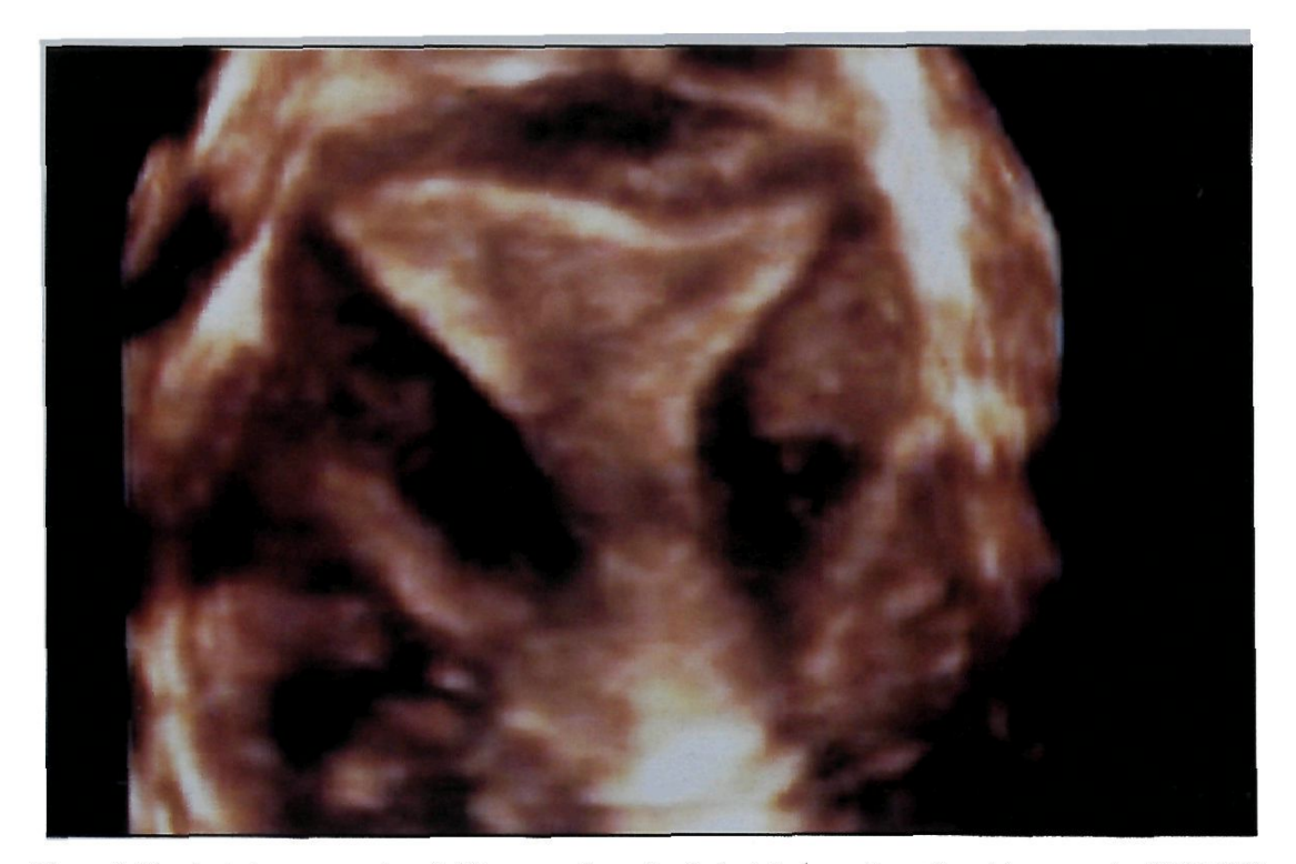
Figure 3. Focal uterine contractions (white arrows) causing indentations on the endometrium seen by 3D TV US.