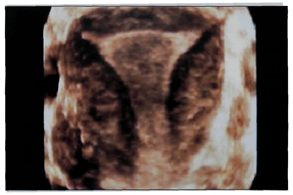
Figure 2. Normal endometrium and homogenous myometrium in 3D Ultrasound