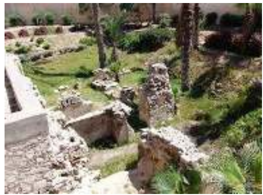
Fig. 5. the tombs Anfoushy. After . Venit, Marjorie S., (2002) Monumental Tombs of

The tombs of Anfoushy date to the Ptolemaic era, they consist of seven graves, each of which includes a number between 10 and 15 compartment, and places dedicated to visit the dead, and for living and dining, and is characterized mostly by decoration and murals. and combines inscriptions of ancient Egyptian and Greek. Unfortunately the groundwater threatens these tombs (Fig. 5.)^{22} .