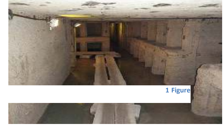
Fig.10. the tomb of Kom Shokafa drowned by underground water. After; Ezzat Kados(2000), Monuments of Ancient Alexandria. Fig41

private tomb, later converted to a public cemetery and It consists of 3 levels cut into the bed rock, a staircase, a rotunda, the triclinium or a banquette hall, a vestibule, an antechamber and the burial chamber with three recesses on it; in each recess there is a sarcophagus. The tomb of Kom Shokafa drowned by underground water (Fig. 10)<sup>32</sup>.