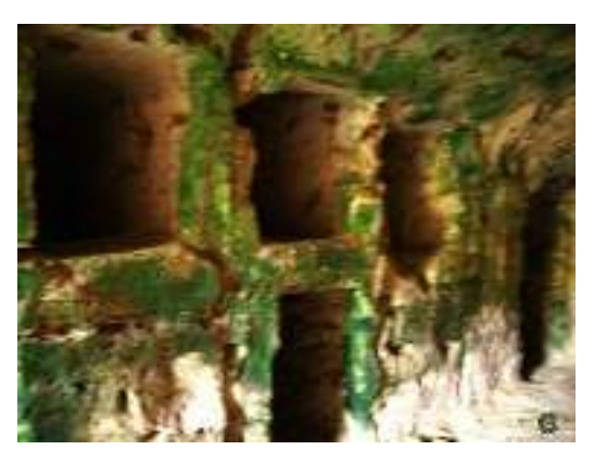
Fig. 7. Growth of the a algae around the loculi. the tombs Anfoushy. Fig

Some of the wall paintings in the Anfoushy chambers are preserved in an excellent state, showing each detail in clear colours. However, while some are exceptional, the majority has suffered from years of annual flooding and the deterioration is getting worse each year. We were Fortunate to visit the cemetery when a German archaeologist was working with the constantly flooded tomb, describing to us all the problems they dealt