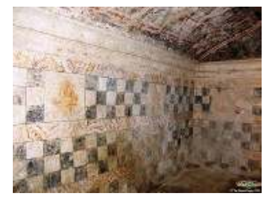
Fig. 6. the walls structures which oversaturated with humidity, saltines and parasites. the tombs Anfoushy. After . Venit, Marjorie S., (2002) Monumental Tombs of Ancient Alexandria. Fig XXV

The report pointed out that groundwater caused significant damage in cemeteries, especially that rocky areas, have leaked salts to the walls, leading to fragmentation and thus need fast action to lower the water table down graves from all directions, and to address the main reason for the deterioration of the structural situation as well as to develop an emergency plan for the care of them, given the outstanding role in promoting tourism<sup>25</sup>.