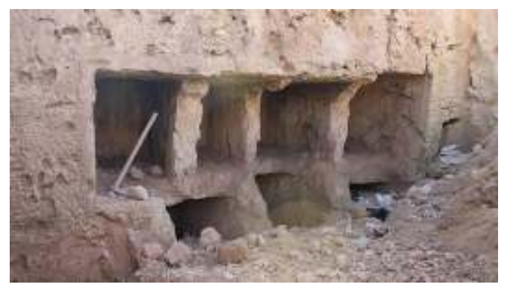
Fig. 2. El Gabbary Tomb. After:Mckenzie, J., (2007)The Architecture of Alexandria and Egypt, Fig 3.

grabbing soil, stones, and antiquities<sup>13</sup>.