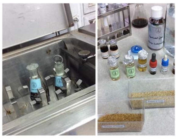
Figure 1. Preparation of the natural allergenic extracts from crumaterials in the Allergy Lab, Microbiology & Immunology Unite, RIO

shaking in electric shaker for more than two hours for two successive days. 3. Primary filtration by the usual filter paper and secondary filtration by Millipore Syringe filter (Ministart) 0.2 \mu m into sterilized sealed glass bottles (vaccine bottle) were performed. Checking the sterility of the allergenic extract was done by culturing on blood agar aerobically and anaerobically, by then it was ready to be used for SPT, (Figure 1 and Figure 2).