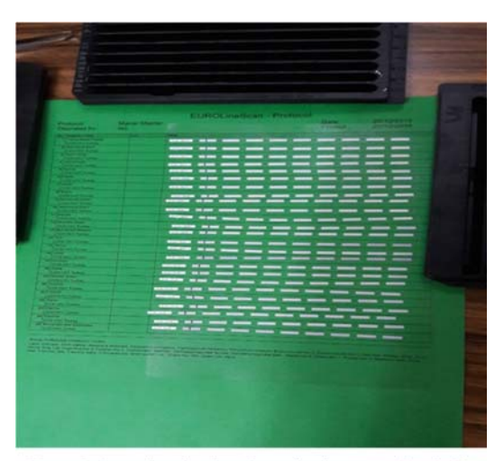
Figure 5. Test strips placed on the evaluation protocol ready for digital evaluation.