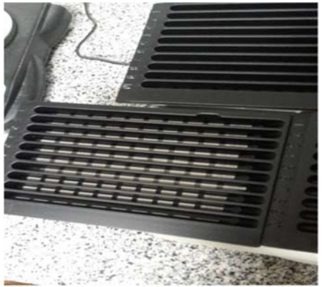
Figure 4. Test strips coated with allergens in the incubation tray.