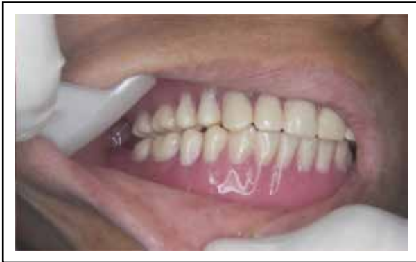
Fig. (1) Finished denture in place with median lingualized occlusion.

Patients sharing in this study were randomly divided into two equal groups: Group A: Patients received a new complete denture with a bilateral balanced occlusion. Group B: Patients received a new complete denture with a balanced median lingualized occlusion. (figure 1)