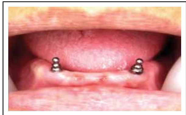
Fig. (2) The two ball attachments in place.

rubber O-rings were incorporated into the ball abutments and the mandibular denture was checked for stability over the two ball abutment. Undercuts under the sockets were blocked out with soft wax. Immediately loaded implant with ball and socket attachment. (Figure 2)