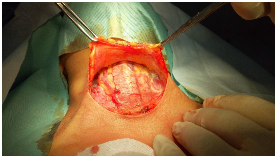
Figure 1: dissection of the upper flap through sub-platysmal plain.