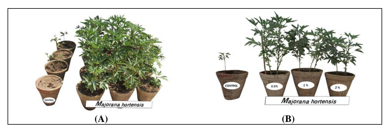
Fig. 1. Effect of marjoram essential oil (A), at three concs. 0.5%, 1% and 2% (B) on Fusarium oxysporum infection of roselle plants compared with control.