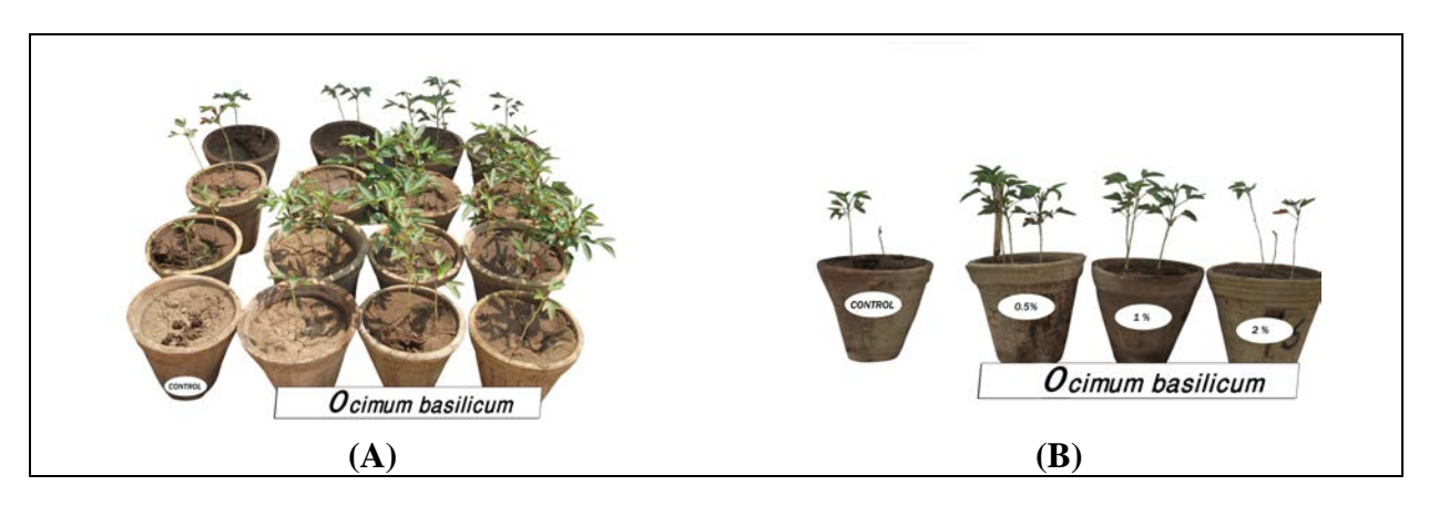
Fig. 3. Effect of sweet basil essential oil (A), at three concs. 0.5%, 1% and 2% (B) on Fusarium oxysporum infection of roselle plants compared with control.