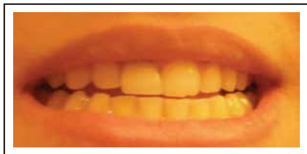
Fig. (3) Clinical photograph showing upper right central incisor single crown cemented to Biohorizons implant fixture

Lava™ Frame Zirconia mill blanks were used for the fabrication of frameworks for all-ceramic restorations (Lava™ framework Ceramic, 3M ESPE AG, Seefeld, Germany). The frameworks are designed at the Lava Scan™ . After milling, the frameworks were dyed with one of the seven Lava Frame Shade dyeing liquids as required to achieve the desired tooth color, then sintered. Lava™ Ceram was used for veneering (Lava™ Ceram, 3M ESPE AG, Seefeld, Germany). The interior surfaces of the crowns cleaned and blasted with aluminum oxide 40\mu\text{m} , A conventional glass ionomer cement was used (Ketac™ Cem, 3M ESPE AG, Seefeld, Germany). (Fig.3)