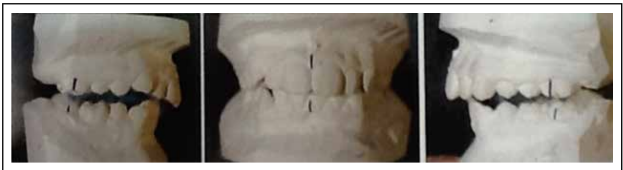
Fig. (4) Casts mounted in myocetric position: a) right molar side; b) incisal side, c) molar side