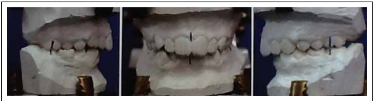
Fig. (3) Dental mounted in habitual occlusion: a) right molar side; b) incisal side, c) molar side