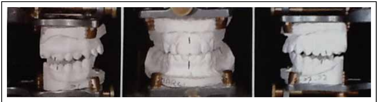
Fig. (2) Casts mounted in myocetric position: a) right molar side; b) incisal side, c) molar side