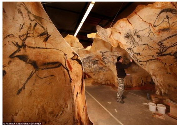
Figure 2. Drawing design of the replica according to the original model.