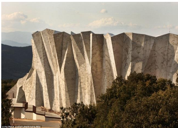
Figure 3. Replica of the cave is the biggest in the world.