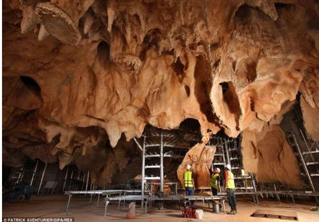
Figure 1. The construction of Chauvet-Pont-d'Arc Cave replica.