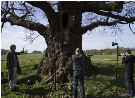
Figure 4. Old Oka tree at at Windsor Great Park, England.

technology to make it possible to scan this 900 year old oak tree ( Factum arte Company, 2018c).