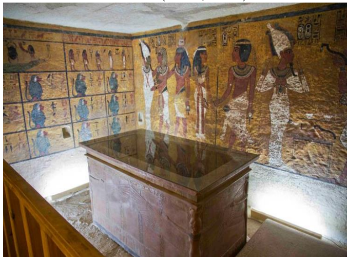
Figure 8. Facsimile of the Tomb from inside.