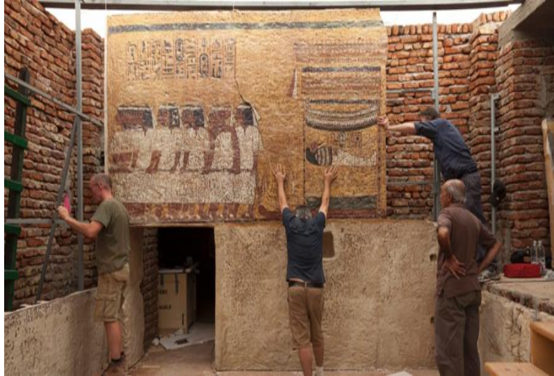
Figure 7. The assembly process of the tomb.