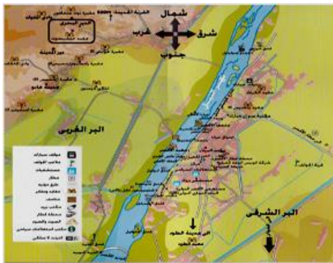
Fig. 1: A map of the archeological sites at Luxor

Thebes, Modern Luxor, is one of the first archeological sites that listed by the UNESCO in 1979 as a World Heritage Site (Fig. 1). It is located 900 km south of Cairo on the banks of the River Nile. The Theban Necropolis lies on the West Bank that is known as "Antiquities Land" (the expression "Antiquities Land" denotes that the land is under the control of the SCA and this was referred to in a law passed in 1956) and covers about 10 km (Weeks and Hetherington, 2014). It houses tombs and temples dating from the early Middle Kingdom to the Ptolemaic Period. The 18th Dynasty temple of Queen Hatshepsut, known as "the temple of Deir al-Bahari", is one of the best preserved funerary temples that the area housed (Fig. 2). (Shaw and Nicholson, 1995)