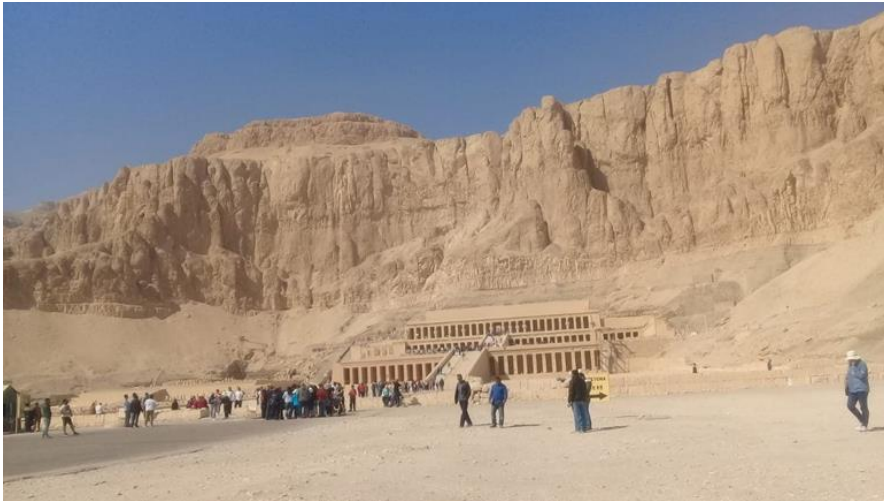
Fig. 3: View of the temple of Hatshepsut constructed into a natural embayment in the cliffs

The sanctuary of god Amun in the temple of Hatshepsut was illuminated twice a year by the orthogonal rays of the rising sun. The site of the sanctuary beneath the Theban massif symbolizes the site of the sunset. Such astronomical phenomenon occurred during the reign of Queen Hatshepsut in the mid of both months February and November and lasted for about ten days. (Pawlicki, 2017)