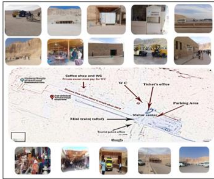
Fig. 4: Tourist facilities surrounding the temple of Hatshepsut