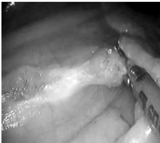
Fig. (1): Freeing of greater curvature.

proximal stomach should be visible. Peritoneal attachments of the greater curvature near the angle of his are divided, and the 60-mm endo-gastrointestinal assisted (GIA) stapler (3.5mm staples) is applied several times across the proximal stomach to create a small (30mL or less) proximal gastric pouch. The patient was returned to the supine position to create the jejunojejunostomy. The greater omentum and transverse colon were passed to the upper abdomen to expose the ligament of Treitz. To create the Roux limb, the jejunum was transected with Endo GIA II stapler, 45mm length and 3.5mm staples, at approximately 30cm from the ligament of Treitz, where a comfortable length of mesentery exists. A smaller staple size (2.5mm) was later substituted to reduce staple line bleeding at the transected bowel. The jejunal mesentery was then divided with two applications of the Endo GIA II stapler using the vascular load (45mm length, 2.0mm staples). The Roux limb was then measured 150cm distally, and a stapled side-to-side anastomosis was created with the