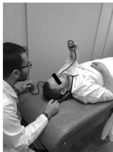
Fig. (1): The craniocervical flexion test.