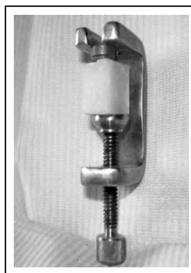
Fig. (1) Holder with block Upper part has U shape space Specimens The lower part has screw

above the surface. The base of the mold resting on a glass slab to obtain a flat smooth surface base. Another special fabricated copper mold, with central hole of 3mm internal diameters and 3 mm height was designed for the purposes of production standardize size of specimen's restorative materials (3X3mm in diameter). This mold has two splitted parts that could be guided to fit into each other with surrounding copper ring. In addition, special fabricated stainless steel holder was designed in Figure (1). This holder consists of two parts; the upper part and the lower part. The upper part together with the lower part allows for adaptation and fixation of the mold ring to the flattened dentin surface during application of the restorative material.