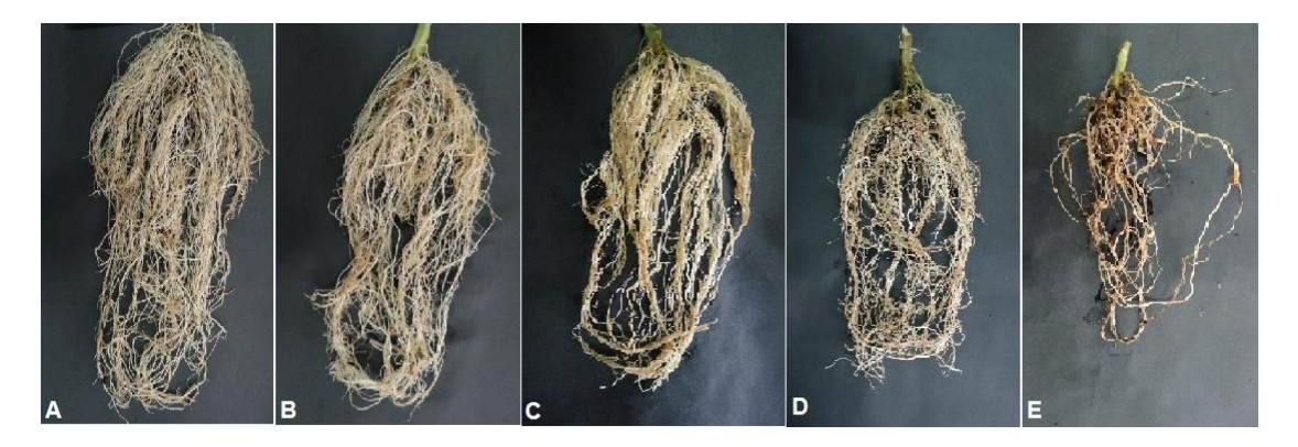
Fig. 3. Impact of different chitinolytic Trichoderma species on root fitness of tomato infected with root-knot nematode ( Meloidogyne incognita ).

Each value presented the mean of three replicates. Means in each column followed by the same letter(s) did not differ at P \le 0.05 according to Duncan's multiple range test.