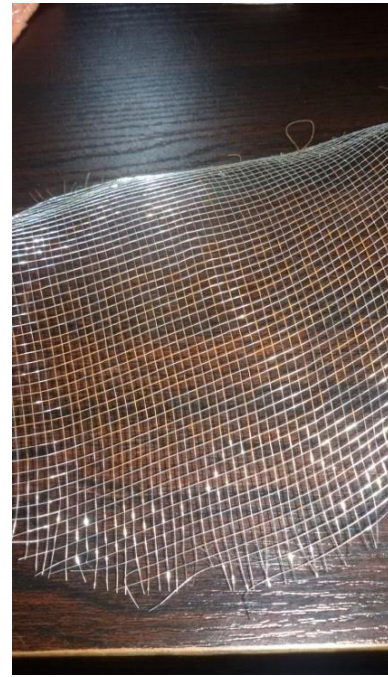
Plate 2b: 0.3cm Smoke Filter Used in EFK

The Drying Chamber: The drying chamber was constructed by fortifying a metal iron mesh with lagging material (refractory) made up of a composite mixture of clay, sawdust, and silicon carbide in the ratio 4:2:0.5. A fish drying stand with three layers was placed in the drying chamber for smoke-drying and a smoke outlet made out of a cylindrical rod of 18.9 cm length and 8.4 cm diameter was built on the side away from the smoke-processor. The drying chamber was fitted with a parabolic dome-shaped cover of diameter 68 cm with the convex side facing the inside. The outer side of the cover and the body of the drying chamber was then covered with a thick paste of lagging material, cemented and then allowed to dry naturally before use.