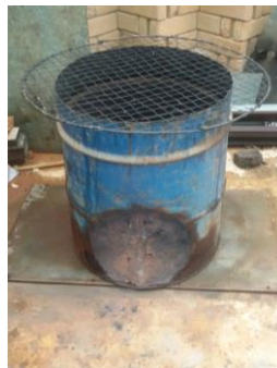
Plate 1: Fully Assembled Traditional Drum Kiln

TDK was constructed from a cylindrical metal drum as is often used in fishing villages where fish processing is done by smoke-drying. The metal drum had dimensions of 72 cm height, 187 cm circumference, and 55 cm diameter at the open top. A circular opening of diameter 36 cm was carved out at the bottom and served as the vent through which wood fuel was arranged and burned to supply heat. A circular wire rack with a diameter of 76.5 cm and mesh size 6 cm X 6 cm was placed on top of the traditional drum and served as the fish drying tray on which the fresh catfish was arranged for the smoke-drying process. The assembled kiln was then placed on a flat rectangular iron base with dimensions 106 cm X 57.2 cm X 1.8 cm for the smoke-drying process in order to protect the cemented floor from cracking from the heat generated when smoke-drying. The fully assembled traditional drum kiln is presented in Plate 1.