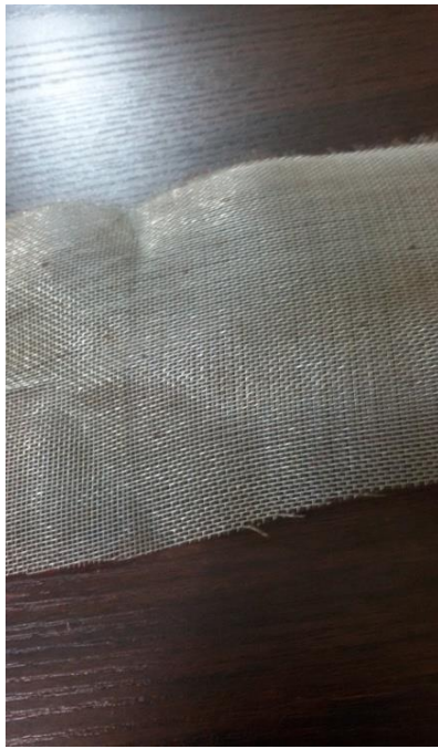
Plate 2a: 0.1cm Smoke Filter Used in EFK

EFK was built with a carrying capacity of about 20 kg. Two smoke filters with diameters 0.1 cm and 0.3 cm (Plates 2a and b) were used in three combinations for this study namely 0.1 cm smoke filter in two layers, 0.3 cm smoke filters in two layers and 0.3 cm smoke filters in four layers. The EFK comprised three parts; the drying, the flame, and the electronic chambers.