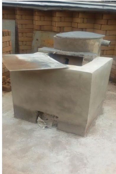
Plate 3: Constructed Ecologically Friendly Kiln (EFK)

on the flame chamber to seal in most of the heat generated from the heat source. The Ecologically Friendly Kiln (EFK) as used for this study is presented in Plate. 3.