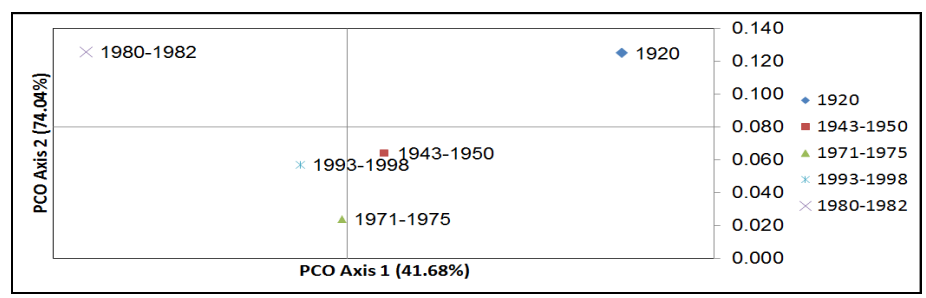
Figure (2): Two-dimentional principal coordinate analysis of five Egyptian cotton breeding release periods based on RAPD markers.

On the bases of Nei coefficient for RAPD markers, the five cotton breeding periods were classified into four major groups. However, based on Euclidean distance for agronomic traits, the five Egyptian cotton breeding periods were classified into three major groups. The PCOA1 and PCOA2 axis explained a reasonable amount of variation 41.68% and 74.04%, respectively. A significant correlation coefficient between gene diversity and the number of fragments was high, r = 0.985 (P> 0.01). Furthermore, analysis of molecular variance (AMOVA) revealed non-significant genetic variance among breeding periods (Table 4). The proportion of RAPD variation accounted for by decadal grouping was low ( \Phi_{PT} = 0.066 , p = 0.230). A genetic shift was observed in the cotton varieties released over the five breeding periods reflecting different breeding efforts. These results illustrate the impact of the cotton breeding on the Egyptian cotton genome. These findings, along with those from genomic RAPD markers, suggest the Egyptian cotton breeding programs have reduced genetic diversity in the Egyptian cotton varieties.