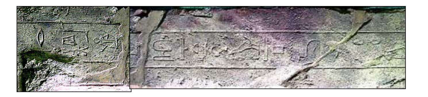
\textbf{Fig. 3:} \ \, \textbf{The texts on the right outer Jamb of the } \ \, chapel