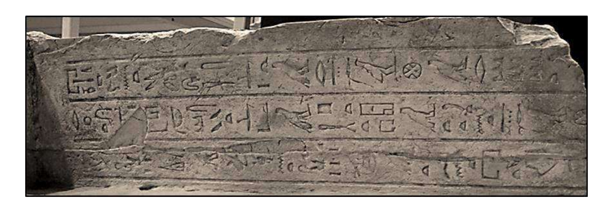
Fig. 4: The texts on the right inner Jamb of the chapel