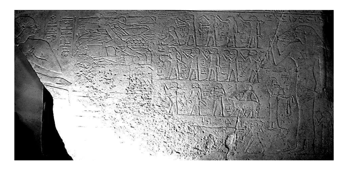
Fig. 6: The main scene of the chapel