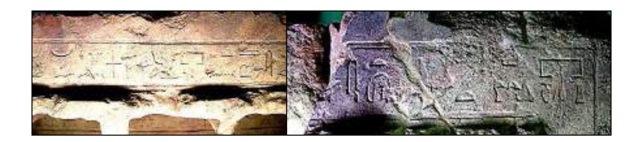
Fig. 2: The texts on the upper Jamb of the chapel