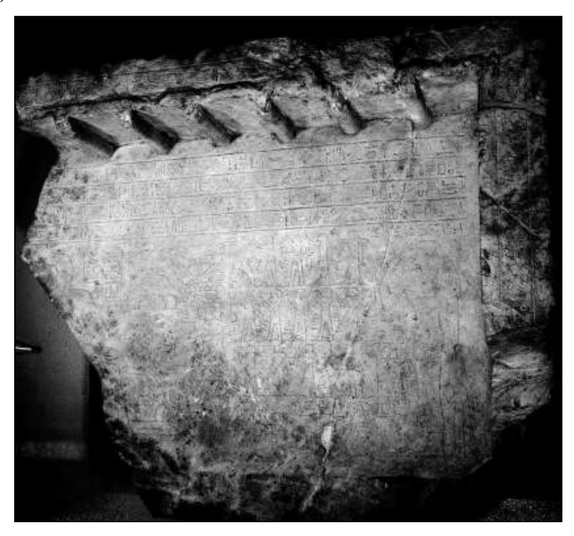
Fig. 1: The chapel of Heryshaefnakht