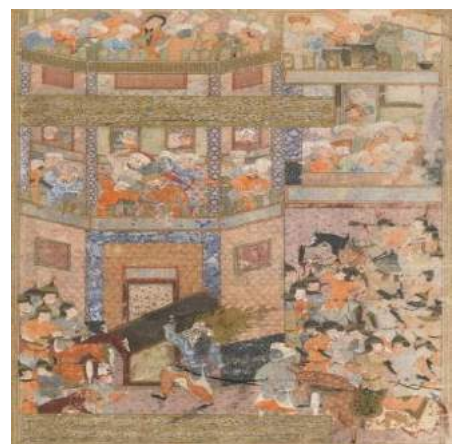
Figure 12-Imam Ali while lefts the gates of Qamus fortress, a folio from manuscript Rawdat al-Safa , Free Art Gallery at Washington, number of preservation S1986.238, Mirkhwand , 1572 A.D.