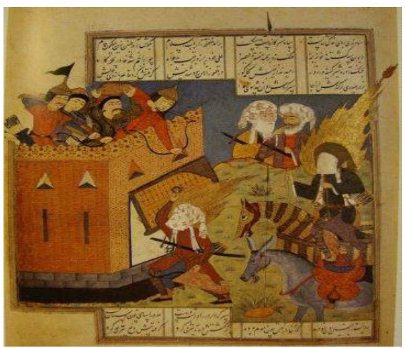
Figure 11-Imam Ali accompanies prophet Mohamed in fighting to take the fortress of Qamus , manuscript Athar al-muzaffar , 1567 A.D., preserved at Chester Beatty library, number of preservation CBL Per 235.