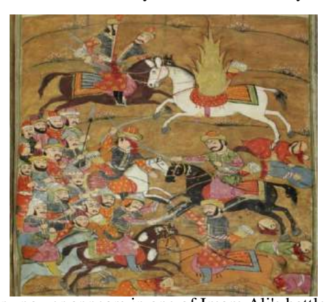
Figure 7- DHU'L-FAOĀR legendary power appears in one of Imam Ali's battles against Eastern kings, folio from manuscript Haydr Nameh , Egyptian National Library at Cairo, 80-Persian history, 115 verso, Century XVII, Moghul -Indian school of art.