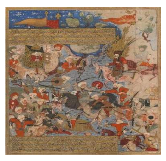
Figure 13- Imam Ali in the battle of camel, a folio from manuscript Rawdat al-Safa , Free Art Gallery at Washington, number of preservation S1986.238, Mirkhwand , 1572 A.D.