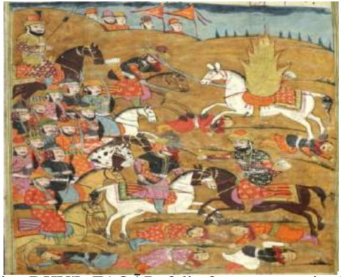
Figure 8- Imam Ali is fighting using DHU'L-FAQĀR, folio from manuscript Haydr Nameh , Egyptian National Library at Cairo, 80-Persian history, 105 recto, Century XVII, Moghul -Indian school of art.