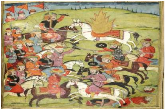
Figure 6 - Imam Ali appears fighting with his sword against his enemies, folio from manuscript Haydr Nameh , Egyptian National Library at Cairo, 80-Persian history, 206 verso, Century XVII, Moghul -Indian school of art.