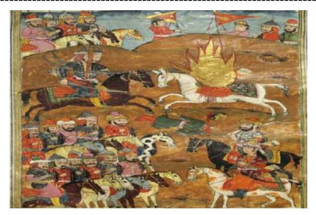
Figure 5- Imam Ali s fighting with his sword at one of the legendary battles, folio from manuscript Haydr Nameh , Egyptian National Library at Cairo, 80-Persian history, 36 recto, Century XVII, Moghul -Indian school of art.