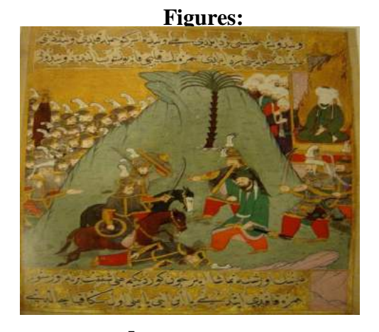
Figure 1- Imam Ali With his Sword DHU'L-FAQĀR at the Battle of Badr , folio from manuscript Siyar-Inabi , 1594-95, Chester Beatty library of Dublin, CBL T419, F.225b, Turkish school of art.