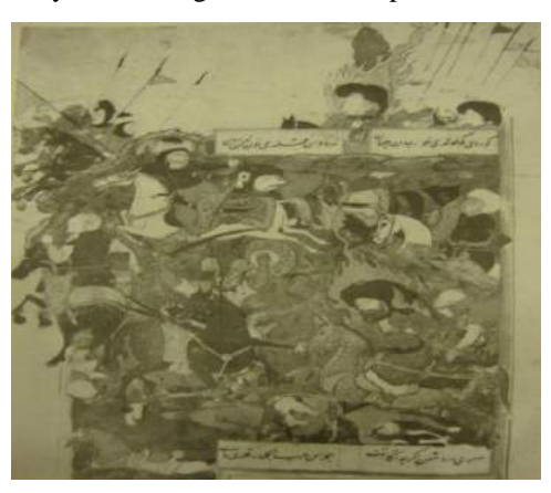
Figure 4- Imam Ali while Fighting in Nahrwan battle, copy of Manuscript "Maqtal al-Rasul", 9 recto, museum of Turkish and Islamic arts in Istanbul, number of preservation T-1958, Turkish school of art.