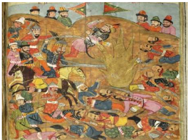
Figure 9- Imam Ali is fighting with DHU'L-FAOĀR at one of the legendary battles, folio from manuscript Haydr Nameh , Egyptian National Library at Cairo, 80-Persian history, 167 verso, Century XVII, Moghul-Indian school of art.