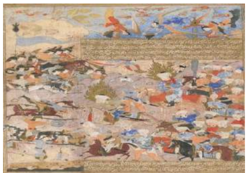
Figure 2 - Imam Ali is fighting his enemy in the battle of Badr , a miniature folio form manuscript of Rawdat al-Safa , 1572 A.D., Free Art Gallery at Washington, number of preservation S1986.23.