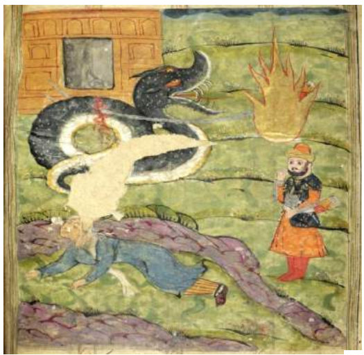
Figure 10- Imam Ali is fighting the legendary animals, folio from manuscript Haydr Nameh , Egyptian National Library at Cairo, 80-Persian history, 239 verso, Century XVII, Moghul -Indian school of art.