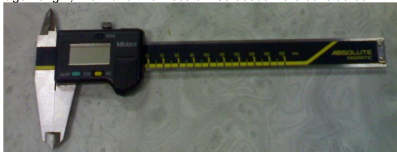
Figure (1): Digital vernier caliper

A digital caliper model (Mitutoyo DAG-500, Japan) shown in figure (1) with accuracy of 0.01 mm, was used to measure the principal dimensions of jojoba seeds length (L), width (W) and thickness (T) in millimeters and the average Length, width and thickness of 100 seeds were considered.