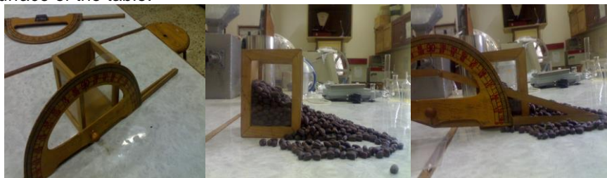
Figure (4): Repose angle meter.

In this test each seeds sample was taken randomly and then poured in the wooden box of the apparatus until completely filling the box (1.25 kg). The surface of the box is carefully leveled and the transparent sliding side is quickly taken up to give a chance for the seeds to flow down under natural slope forming an inclined angle between the box side and the horizontal surface of the table.