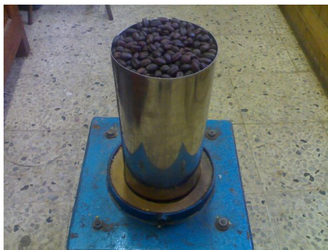
Figure (2): Bulk density meter with shaker.

Porosity of jojoba seeds was determined as a percentage of volume of inters - seed space into the volume of seeds bulk using porosity measuring device shown in figure (3). The apparatus was development by (Mohsenin, 1984) and fabricated according to (Matouk, et al. , 2002).