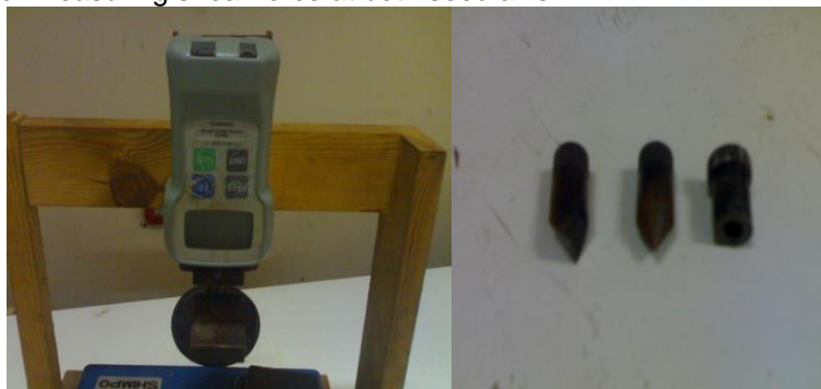
Figure (5): Digital hardness and shear force gauge.

Shear force was measured at both longitudinal and transverse axis. The conical end of the meter was changed to shearing edge (straight sharp edge), as shown in figure (5) and the previously mentioned procedure was used for measuring shear force at both seed axis.