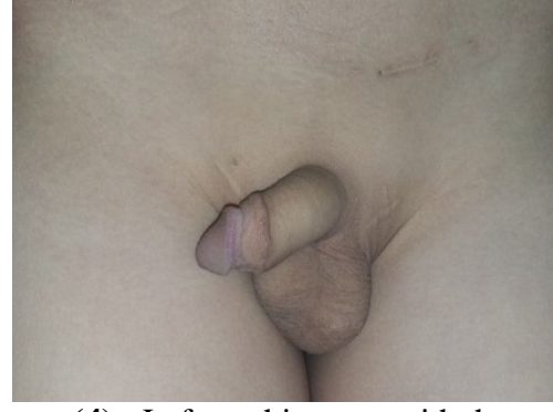
Figure (4): Left orchiopexy with hormonal therapy, 24 months postoperative with good testicular size