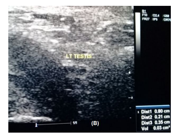
Figure (7): Ultrasound picture showing post-operative left testicular atrophy of a child 5 years old in group B.(testicular volume of Rt testis (A) =1.23 cm<sup>3</sup>, Lt (B) = 0.03 cm<sup>3</sup>). Testicular atrophy index = 97.5 %.