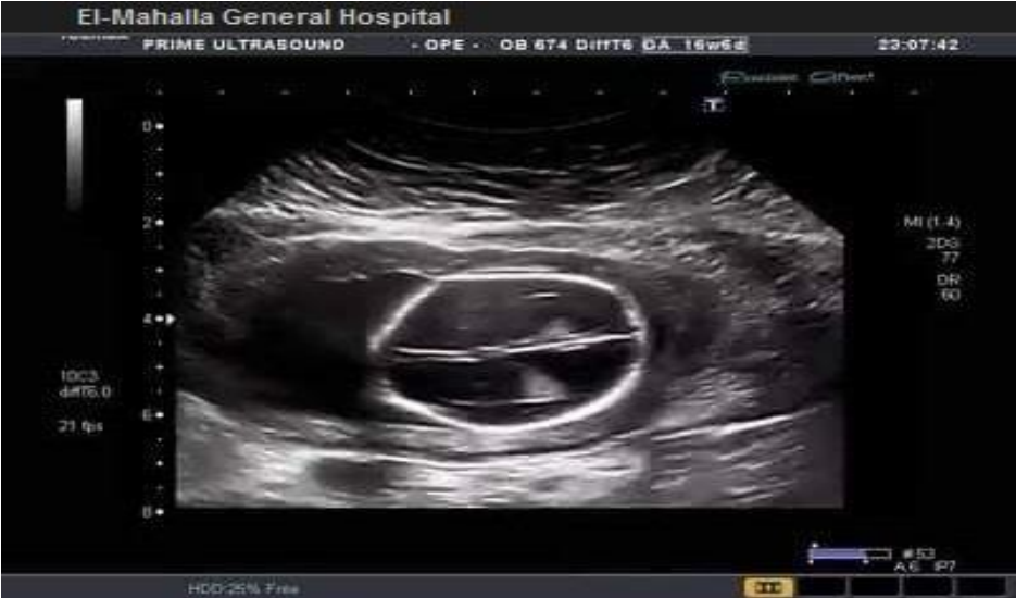
Figure (2): Trans abdominal Ultrasound of hydrocephaly at gestational age 16w+6d.