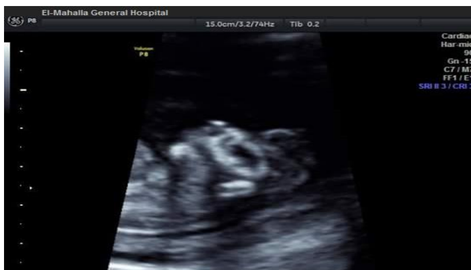
Figure (1): Trans abdominal Ultrasound of anencephaly at gestational age 18 weeks.

OR, odds ratio; CI, confidence interval. Statistical significance was considered at P \leq 0.05 .