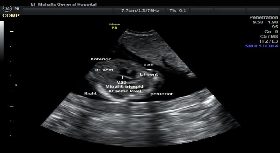
Figure (4 A): Trans vaginal Ultrasound of atrio ventricular septal defect at gestational age 17 week.