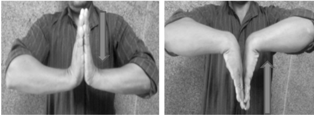
Fig. (5): Follow-up after 6 weeks show range of motion.