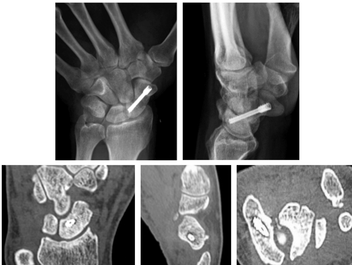
Fig. (4): Follow-up X-ray AP and LAT view after 6 months with complete union and no complication.