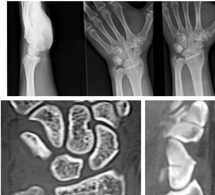
Fig. (3): Pre-operative X-ray AP and LAT views & CT of the fracture.