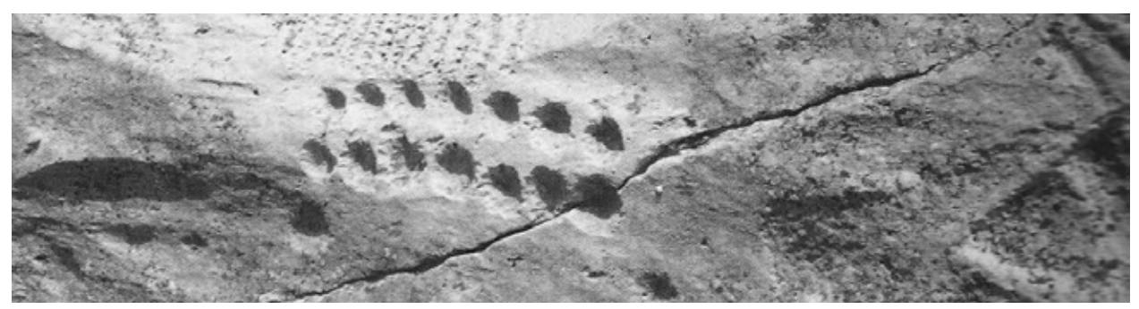
(Fig. 1) Double Row of Cup-Marks from Al-Jassasiyah.

Qatar is a Peninsula located along the west coast of the Arabian Gulf, between latitudes 240 40' and 260 10' north, and longitudes 500 45' and 510 40' east. The peninsula and a number of small islands surrounding it cover an area of some 11,347 km² (Map 1). It lies on the broadest part of 'Arabian Platform' of the Arabian Shelf with the underlying basement rocks of the Arabian Shield. The country extends into the Arabian Gulf for about 180 km, with a maximum breadth of 85 km, and is bordered by the Arabian Gulf from west, north and east, and beyond its southern limit is the Kingdom of Saudi Arabia. In the South, the terrain is mostly flat and stony desert with sand dunes.<sup>7</sup>