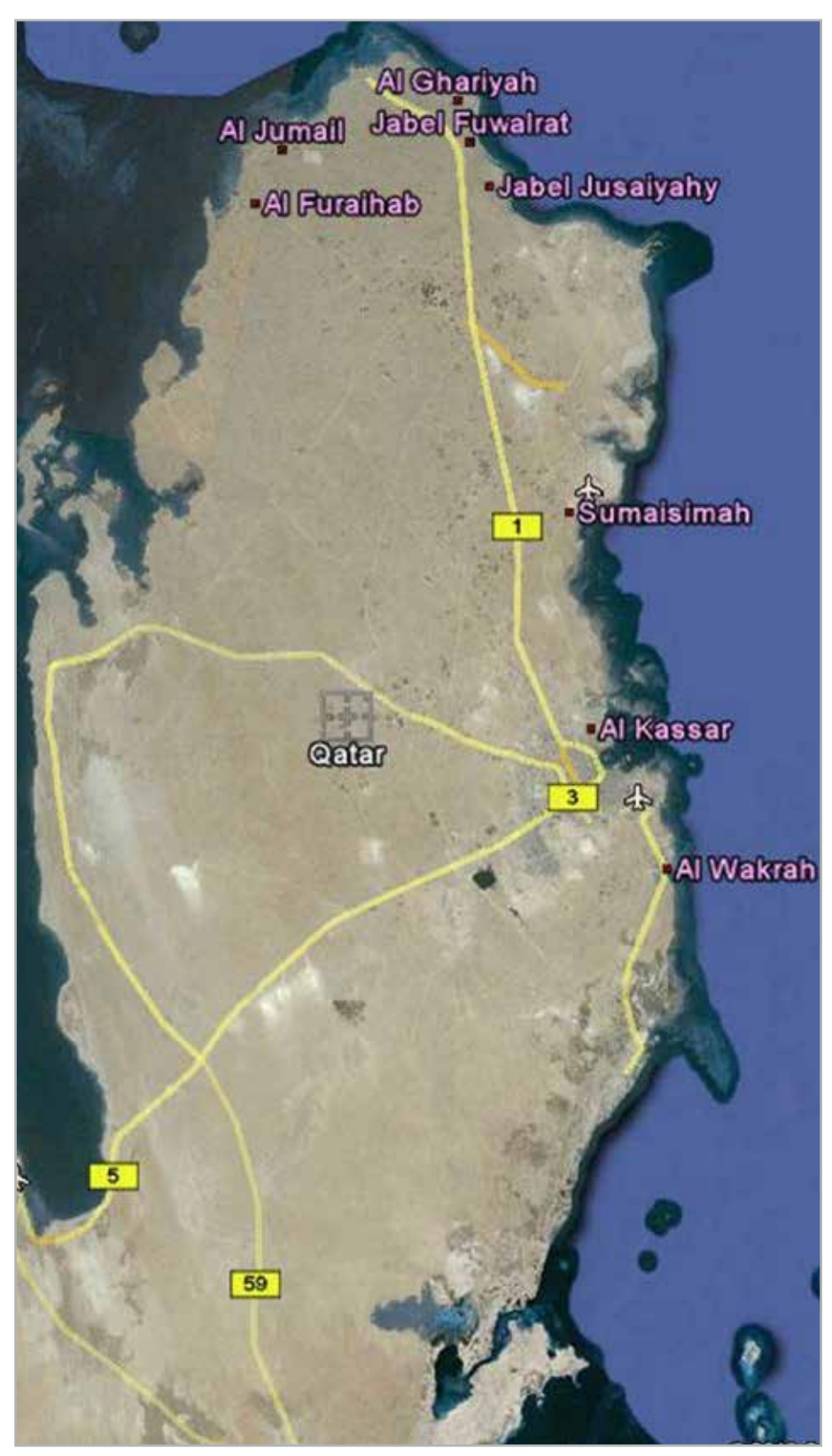
(Map 1) Site Location in the State of Qatar.