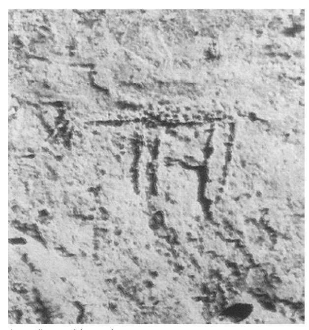
(Fig. 4) Possibly an ibex.