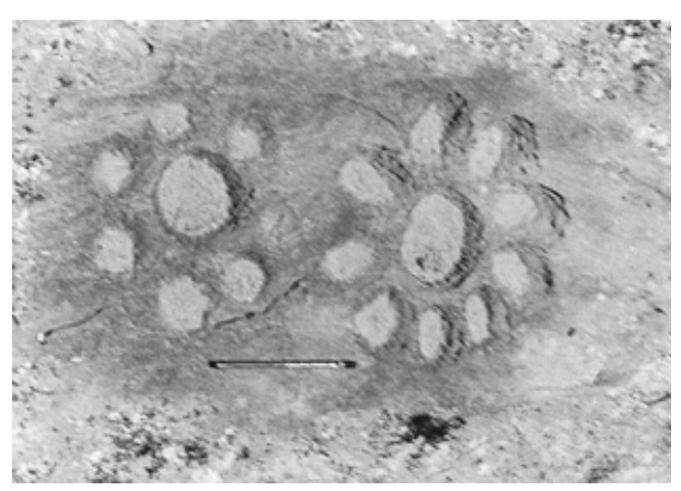
(Fig. 2) Rosette of Cup-Marks from Al-Jassasiyah.

1. Cup marks: Cup marks are the most dominant features of the carvings and provide a means of classification. The carvings in first group classified by cup marks have circular units that compose holes in the rocks, organized in two or four parallel lines beside each other (Fig. 1). Some of them are shaped like a curve that resembles a simple crescent, as found at Al-Jassasiyah and Al Jubiulat.11 Carvings in the second group classified by cup marks, as found at Al-Fuwairat and Al-Ghariyah, 12 show circular arrangements of cups consisting of deep holes surrounded by other central circular units that are less deep and much smaller. These arrangements are similar to rosettes or a shining sun (Fig. 2).<sup>13</sup> The cup marks have been denoted