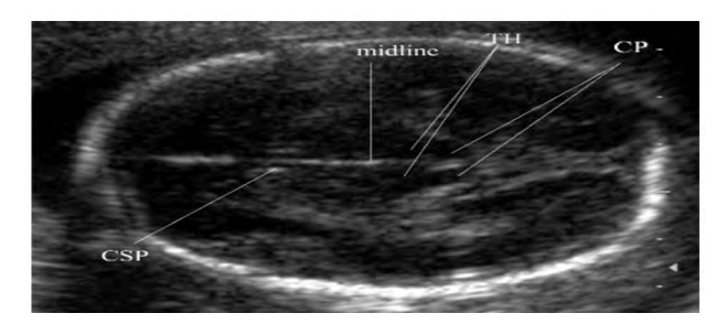
Fig. (1): Transverse section of the fetal head demonstrating the landmarks required to measure the BPD using the thalami view.

CP: Cerebral Peduncles. CSP: Cavum Septum Pellucidum. TH: Thalami.