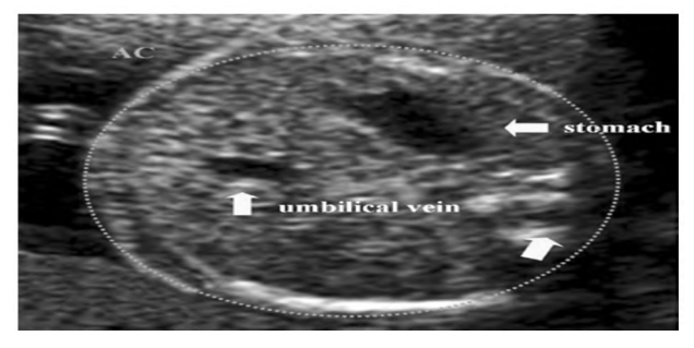
Fig. (3): Measurement of the fetal Abdominal Circumference (AC).