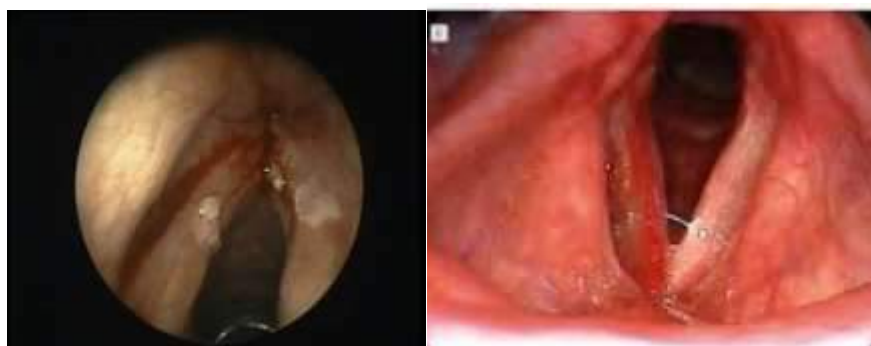
Fig. 4. Pre and 3 months Post radiotherapy follow up