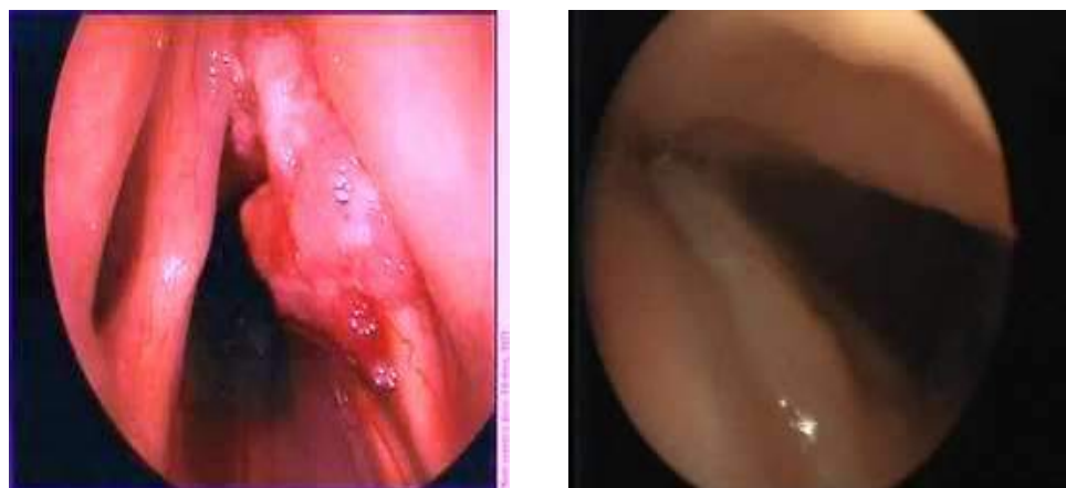
Fig. 1. pre and postoperative view after lateral endoscopic laryngectomy.