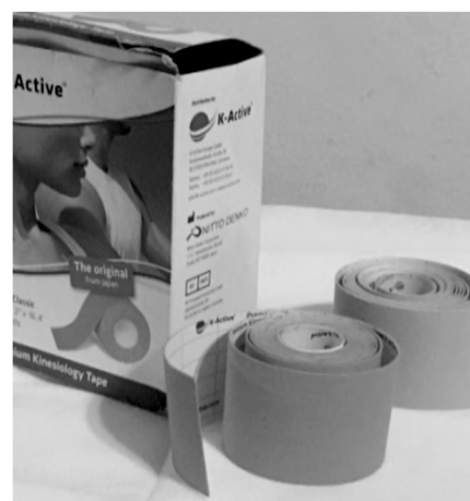
Fig. (1): Kinesio tape bands, K Active, Germany.

Group II: This group was treated by TENS, it was applied by using ENRAF device (Myomed 932) in form of symmetrical biphasic rectangular pulses for 100ms. Frequency was 80Hertz with setting four 5cm 2 surface electrodes placed on the painful lumbar region of each patient for 20min., the intensity was adjusted to produce a tingling sensation approximately 2-3 times above the sensory threshold. Patients received a total of 6 TENS therapy sessions (twice weekly) during 3 weeks. After 3 rd week, the data of participants who completed the study were analyzed.