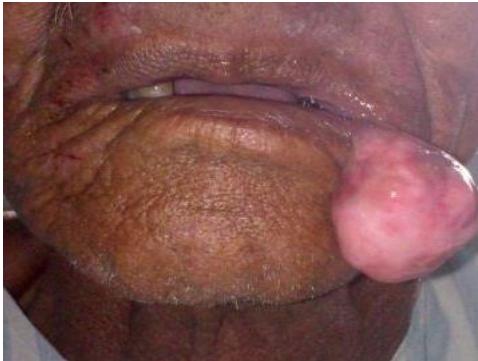
Fig 1. Prolapse of mass outside the oral cavity.