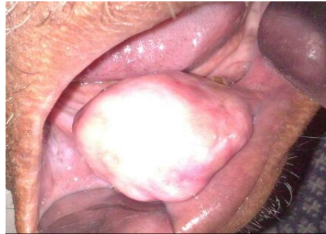
Fig 2. A pedunculated mass seen arising from the left buccal mucosa.