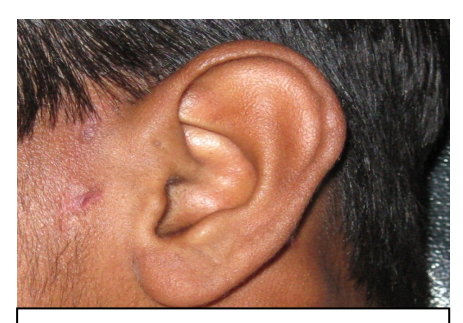
Figure 1: Pre-operative photograph showing pre-auricular sinus as a small pit close to the anterior margin of the first ascending portion of the helix

Most of the patients came with acute tender preauricular swelling found out to be preauricular abscess due to infected preauricular sinus. All were first managed conservatively with or without incision and drainage and after 4-6 weeks they were operated upon. Meticulous follow up showed no recurrence.