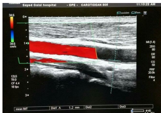
Figure (2): Measurement of IMT using Doppler US in a hemodialysis patient. IMT thickness = 1.2 mm. The increased IMT was directly linked to high levels of serum ADMA which was responsible for increased morbidity and mortality in these patients.