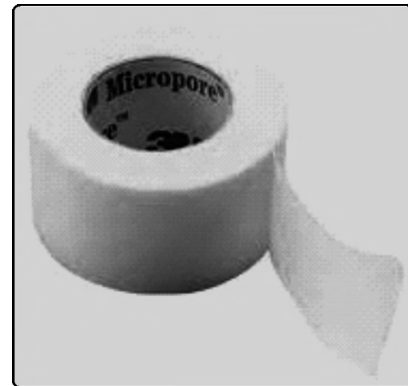
Fig. (2): Micropore Tape.

care (dressing) 30 minutes 3 sessions/week for 12 weeks.