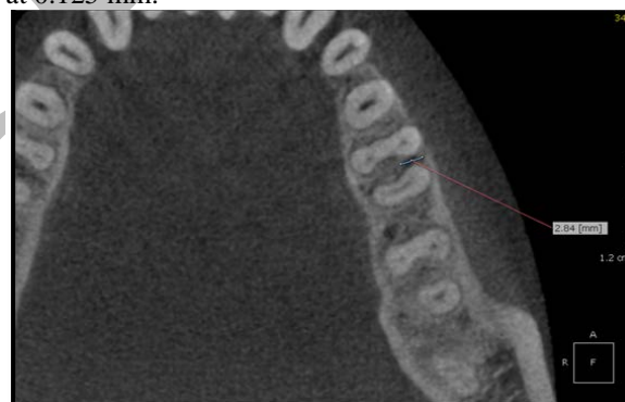
Figure (1): CBCT BL-H measurement

The slice thickness was set at 0.5 mm, and the pitch was set at 0.125 mm.