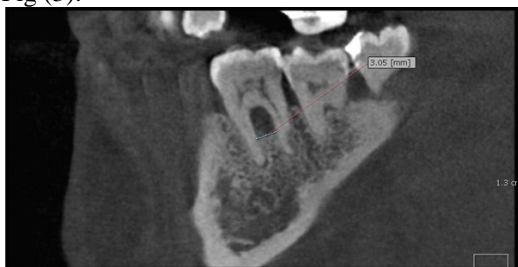
Figure (3): CBCT FW measurement

3- Degree of bone loss in vertical direction (BL-V) was decided by measuring the distance from the furcation entrance to the base of the defect in the vertical direction. Fig (3).