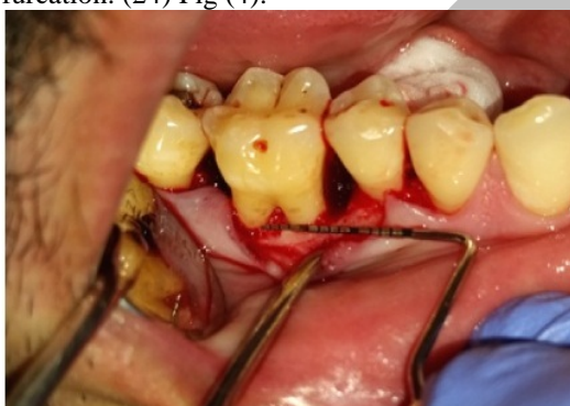
Figure (4): intra-surgical FW measurement

4- The width of the furcation entrance (FW) was measured by measuring the greatest mesio-distal distance in the furcation. (24) Fig (4).