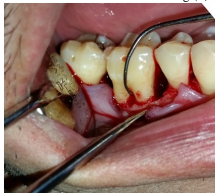
Figure (6): intra-surgical BL-H measurement