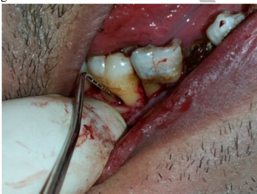
Figure (5): intra-surgical BL-V measurement