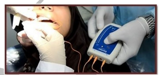
Figure 3: Showing EMG-guided BTX-A Injection Procedure.