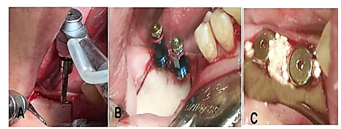
Figure 2: Control Group

A: Corresponding implant shaping drill for shaping planned implants osteotomies.