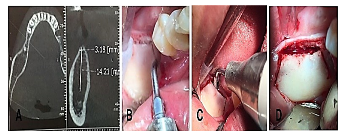
Figure 1: Control Group

The conical CS4, CS5 and CS6 tips from the Crest-Splitting Kit were then used gradually to increase the resulting osteotomy-gap from 1 to 4 mm. Implant-insertion started immediately after the horizontal expansion, following precisely the drill-protocol provided by the implant-manufacturer and followed by implant insertion using a torque-wrench. Synthetic bone graft material packed into the interpositional spaces to prevent soft tissue invasion to the surgical site. Finally, a periosteal releasing incision were performed on the base of the inner aspect of the flap (periosteal side) in order to obtain tension free woundclosure and to compensate for increased ridge width. Closure was performed using 5–0 Vicryl sutures (Ethicon, UK). (Figures 1& 2)