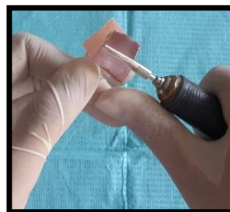
Figure 4: Showing Finishing with tungsten carbide bur and then by sand paper.