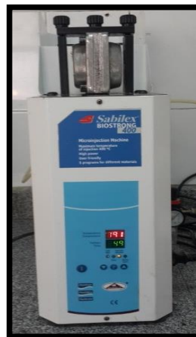
Figure 3: Showing An electric cartridge furnace (Sabilex BIOSTRONG 400). The cartridge is aligned with the flask opening.

The thermoplastic denture base materials were available in the form of granules in cartridges of different sizes (32). A medium size cartridge was used and petroleum jelly was applied on its outer surface. While injecting, the cartridge was aligned with the flask opening. A cartridge was then placed in electric cartridge furnace (Sabilex BIOSTRONG 400. Microinjection machine). (Figure 3)