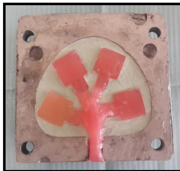
Figure 1: Showing -Each wax specimen was attached to sprue

then the four sprues were united to form one common sprue.