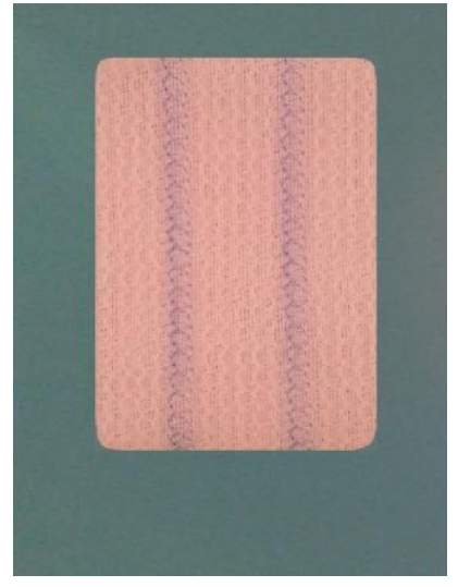
Fig 2: Proceed® mesh (polypropylene soft mesh encapsulated with PDS and layered in one side by ORC)