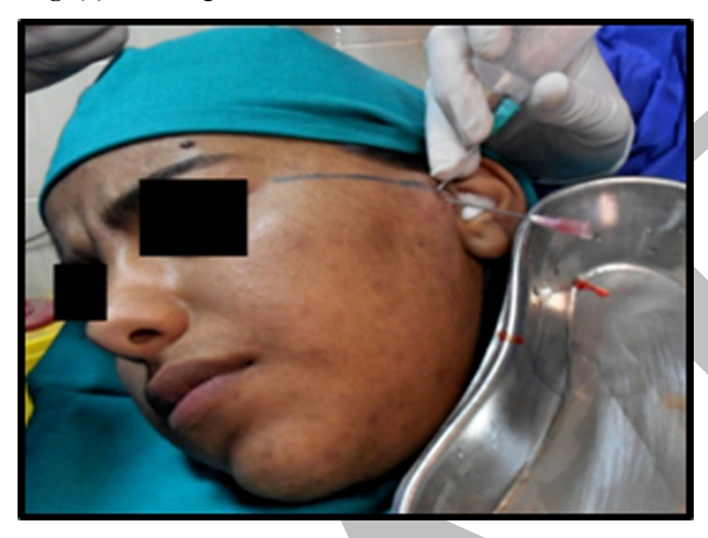
Fig. (4): Showing arthrocentesis.

The procedure of superior joint lavage took from 15-20 minutes. Gentle finger pressure was done over the skin area where the two needles met to help holding the two needles together and to facilitate the outlet flow. During the procedure, the outlet needle was momentarily blocked with finger pressure 2-3 times to help distend and break up the joint adhesion and in group II at the end of procedure the outflow needle was removed and first needle was used to inject 2 ml (40 mg) of piroxicam (Feldene:1 ml ampoule piroxicam manufactured by Pfizer S.A.E) into the joint spac. (Fig. 5)