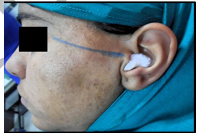
Fig. (2): Showing canthal-tragus line.

A line was drawn from the corner of the eye to midpoint of tragus (canthal-tragus line), the first mark was made 1cm from the tragus, and the second mark was made 2 mm below. (Fig. 2)