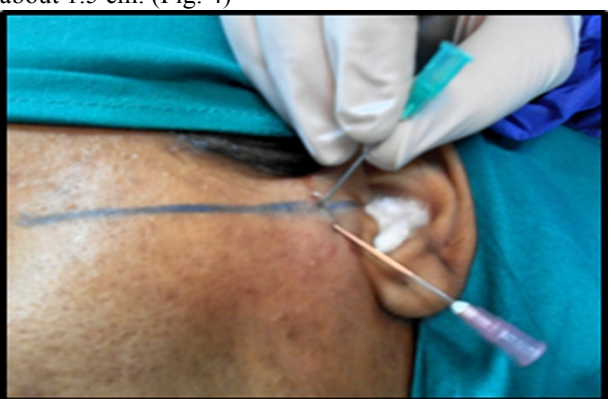
Fig. (3): Showing insertion of inlet and outlet needle.

through opening, closing, protrusive and lateral excursions of the mandible to establish free flow of the solution and release adhesions; then collected into a kidney dish through the outlet needle, inlet needles were inserted to a depth of about 1.5 cm. (Fig. 4)