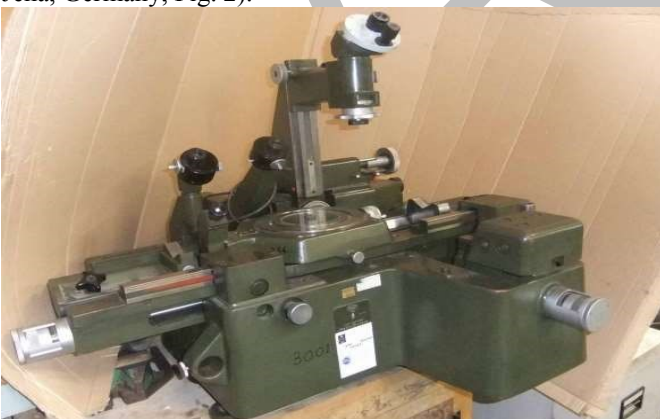
Figure (2): Toolmaker’s microscope.

The dimension stability was evaluated by comparing the length of the middle line of the copper die (X-X’) with the same line in the specimen. The measurements were directly made via toolmaker’s microscope (Carl Zeiss, Jena, Germany, Fig. 2).