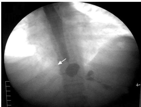
Fig. (2): Gastrograffin study revealed leakage of contrast material at GEJ.