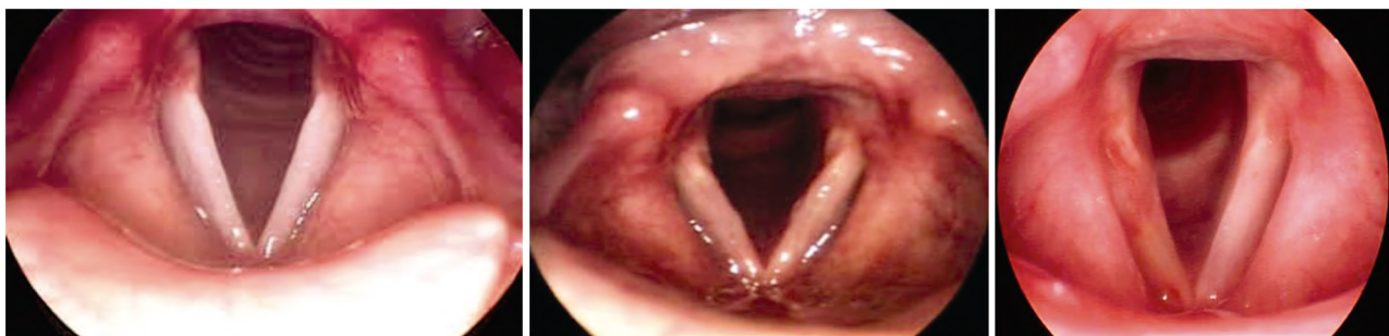
Normal vocal fold before intubation

ings were observed in 4 patients of the control group. Two patients in the control group and 2 in the study group showed vocal fold edema Fig. (2). One week after extubation, residual lesions were still present in 3 patients (12%) of the control group in the form of mild vocal fold edema in one patient and vocal fold congestion in two other patients.