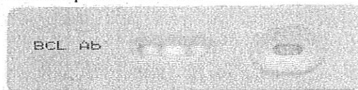
Fig. 2. Positive ICA

Positive: The presence of two color bands ("T" band and "C" band) within the result window, no matter which band appears first, indicates a positive result.