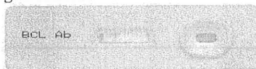
Fig. 1. Negative ICA

Negative: The presence of only one purple color band within the result window indicates a negative result .