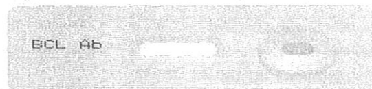
Fig. 3. Invalid ICA