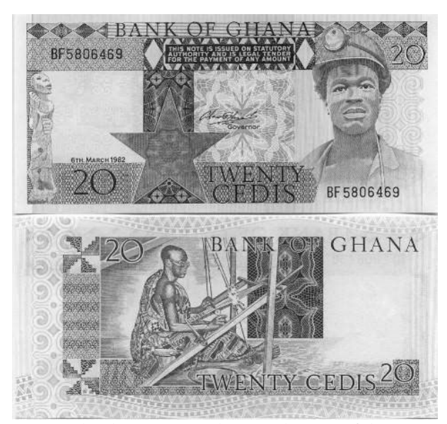
(Fig. 1) The obverse (top) and reverse (bottom) of the \ensuremath{\complement}20.00 note.

The twenty cedi note (¢20.00) note(Fig. 1) was first issued in 1978 during the military regime of the Supreme Military Council under the leadership of General F.W.K.Akuffo, while Alexander Eric