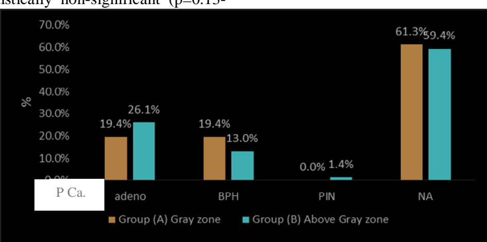
Figure (1): Results of hypo-echoic core histopathology in the study groups.

and in 64.3% (18/28) of group B which was statistically non-significant (p=0.13-