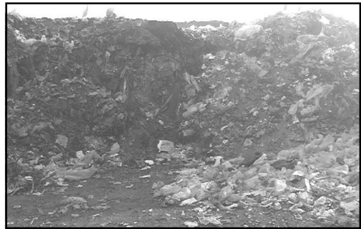
Figure (2): The open dump and waste incineration area at the compost fertilizer plant.