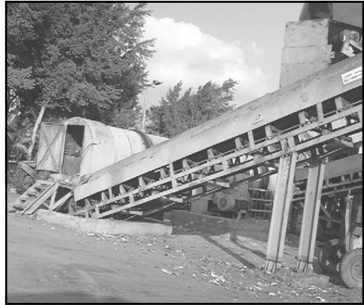
Figure (1): One of the moving belts used in transporting the waste to sieves.