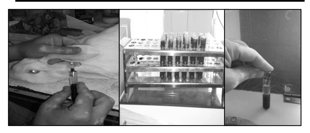
Plate (3): Blood samples collection in tubes from marginal ear vein of rabbit then centrifugated for obtaining serum samples