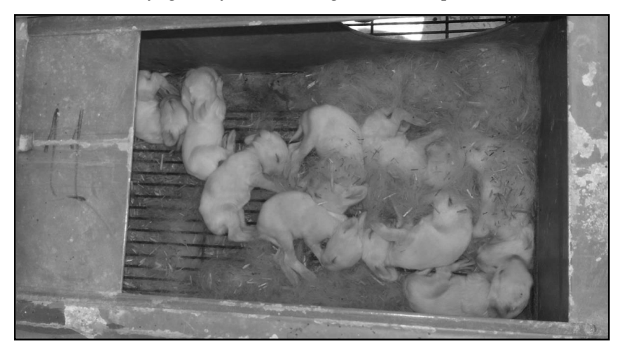
Plate (4): Kits placement inside the nest box